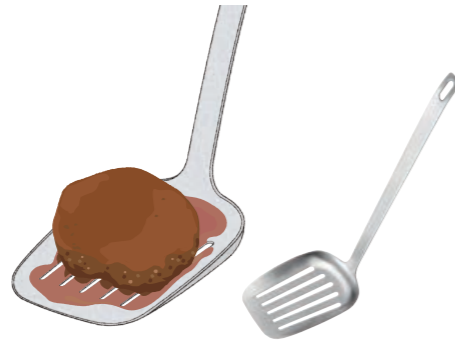
A stainless steel turner that collects sauce as well.