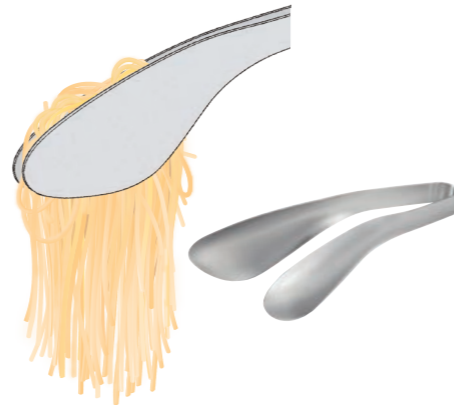
Large volume scooping tongs