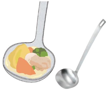
A stainless steel ladle that can scoop to the very bottom.