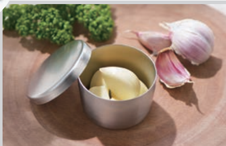
AN0202 and stainless round can 4979487 402026

Mini round cans with a diameter of about 6 cm. Made of stainless steel, it is odor-resistant and easy to clean, can be used for storing leftover garlic, chopped green onions, etc. *This item is a non-airtight container. Please be careful when handling liquids.