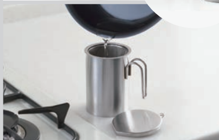
AN0201 and stainless mini oil pot 4979487 402019

Functional small oil pot. Perfect size for temporarily storing food leftover oil from frying. Lid is detachable for easy cleaning or maintenance.