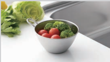
and stainless bowl with handle AN0205 4979487 402057

Mini bowl of approx. 13 cm. The bowl has a handle for stability and smooth mixing. Can also be hung for storage. Convenient size to handle with ease. Dishwasher safe.