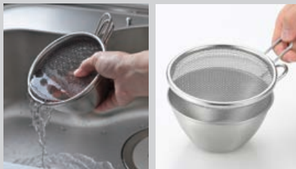
and Stainless Steel Handled Strainer 13cm Shallow Type