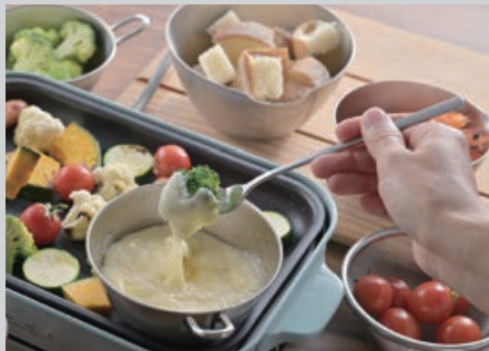
AN0208 and stainless extendable fork 4979487 402088

This fork is crafted for effortless separation, preventing the tip from piercing or falling off your food. Its extended handle is perfect for dishes like cheese fondue and aioli. With a distinctive shape not commonly found, it combines style and functionality. Dishwasher safe.