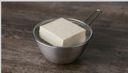
and Stainless Steel Handled Bowl 16cm AN0213 4979487 402132

A hand-handled bowl, approximately 16cm in size, designed for easy mixing and kneading with its deeper structure. The attached handle ensures stability, facilitating smooth mixing actions. Dishwasher safe.