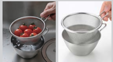
and Stainless Steel Handled Strainer 13cm Deep Type