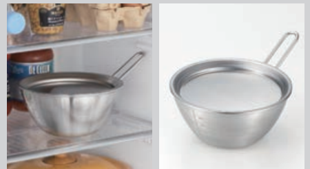
and Stainless Steel Tray 16cm, Doubles as a Bowl Lid