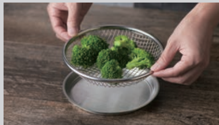
and Stainless Steel Shallow Strainer 16cm AN0215 4979487 402156

A shallow strainer that fits perfectly into a 16cm handled bowl. Convenient mesh design for cooling and draining boiled items. Its simple design is not intrusive, making it suitable for tabletop use. Easy to clean with its durable mesh. Dishwasher safe.