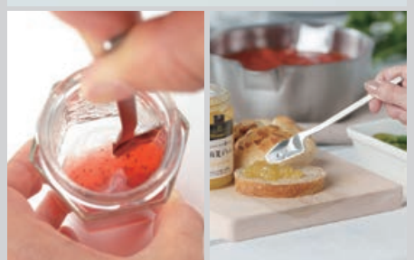
AN0206 and stainless jam spoon 4979487 402064

The jam spoon is designed to scoop jam from jar shoulders and bottoms in a neat and tidy manner. Allows for smooth scooping and spreading. Also useful for butter and dips. Made of stainless, making it easy to clean and maintain.