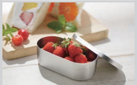
AN0203 and oval type can 4979487 402033

Oval Miniature small can. Use it to hold fruit that doesn't fit in your lunchbox, or use it to store cheese, nuts, and other snacks. Due to its stainless construction, it cools quickly in the fridge and is easy to clean. *This item is a non-airtight container. Please be careful when handling liquids.